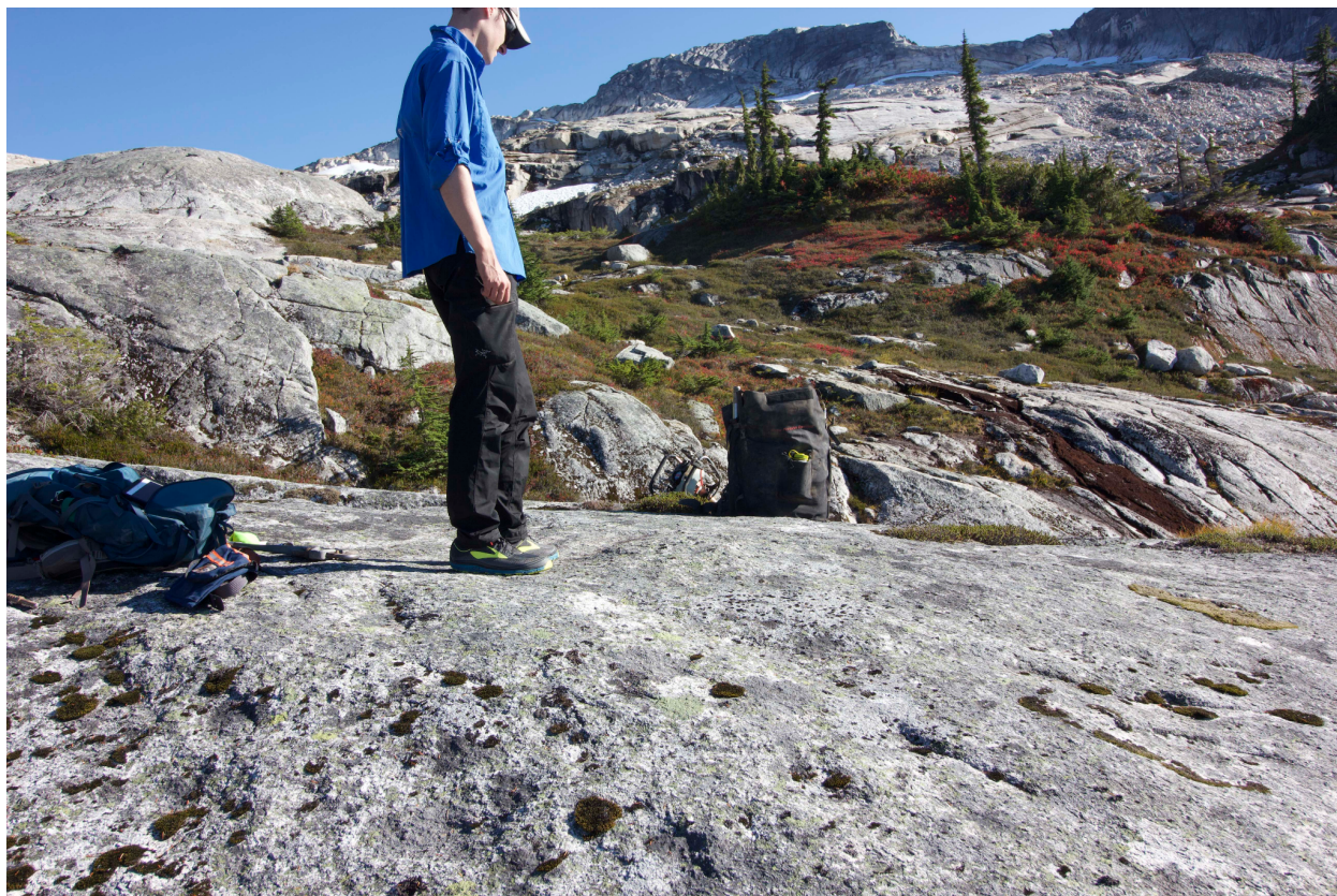
Figure S4: Sampling location of 17-VPC4. Note the cirque headwall of Lockie's Table at the top of the image and a portion of the left lateral moraine in the top right corner of the image.