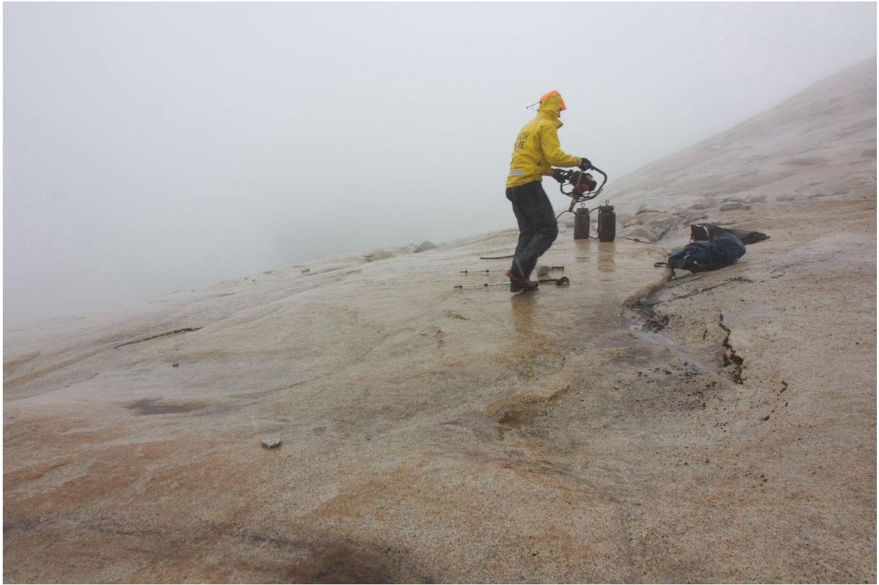
Figure S3: VPC3 Core site. Core collected on bedrock surface next to cobble under author's knee in photo, between trekking poles indicating paleoflow direction (right to left in photo) of Lockie's Glacier.