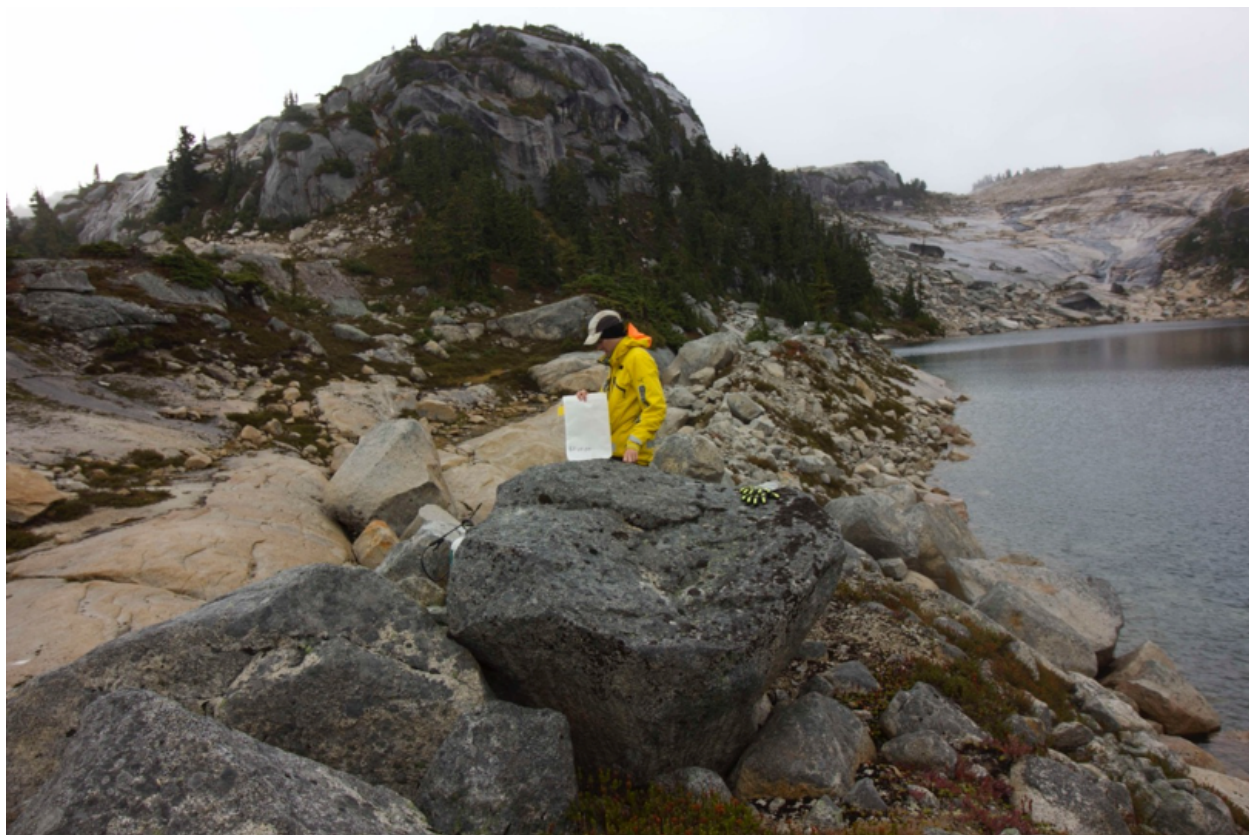
Figure S6: Example boulder (17-VP-04) on the late Holocene moraine deposited by Lockie's Glacier. Note the boulder sits atop a blocky, bouldery moraine draped over bedrock.