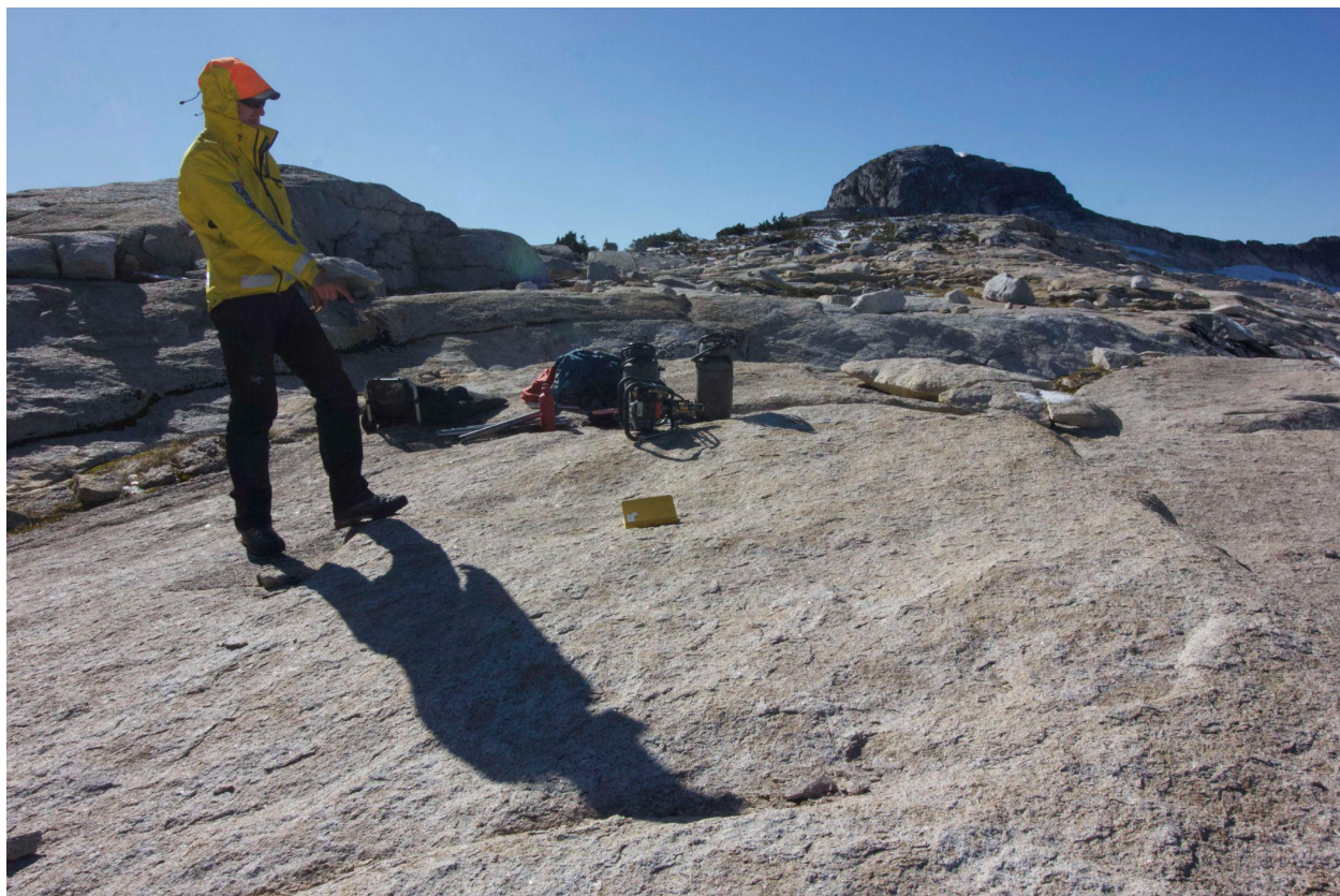
Figure S1: VPC1 Core site, looking South. Summit of Lockie's table in the background.