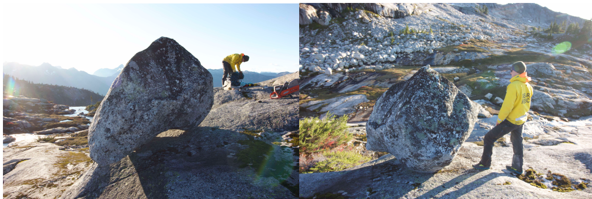
Figure S5: 17-VP-07 erratic boulder.