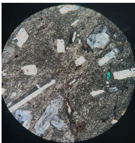
Phonolite P12: sanidine, chlorite, sodalite, clinopyroxene, amphibole, nepheline