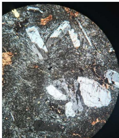
Phonolite P10A: sanidine, sodalite, chlorite, amphibole, orthopyroxene, biotite