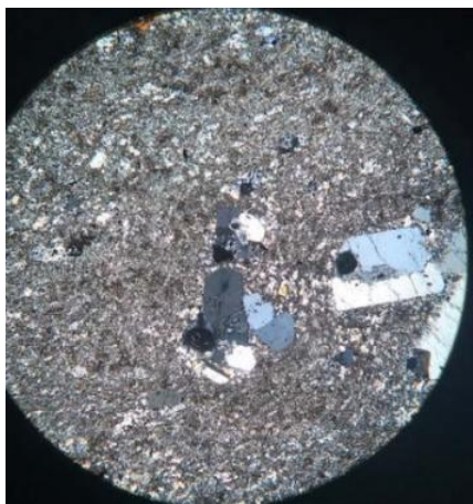
Rhyolite P9: sanidine, quartz, biotite